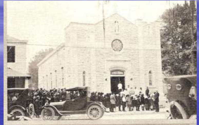
Blessed Trinity Church- 1930