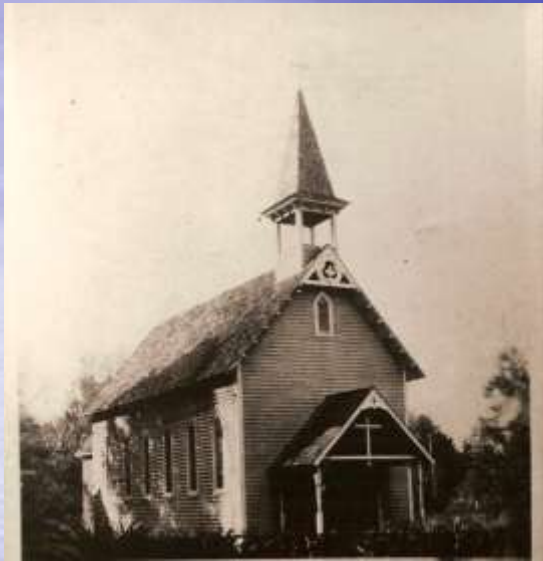
St. Philip Neri-1889